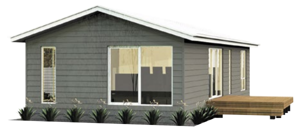
Gable – Standard