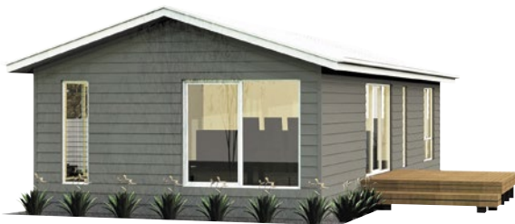
Gable – Standard