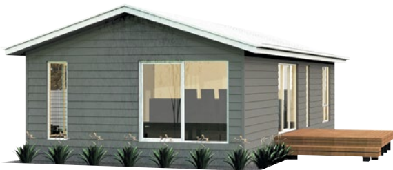
Gable – Standard