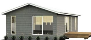
Gable – Standard