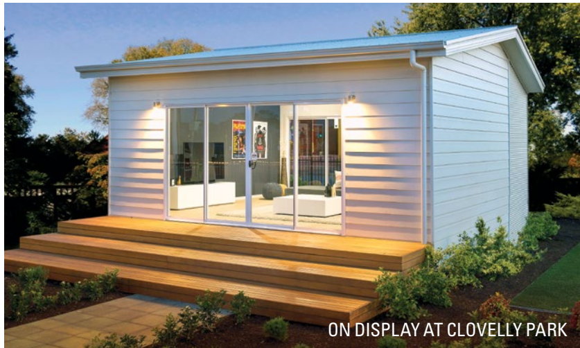
ON DISPLAY AT CLOVELLY PARK