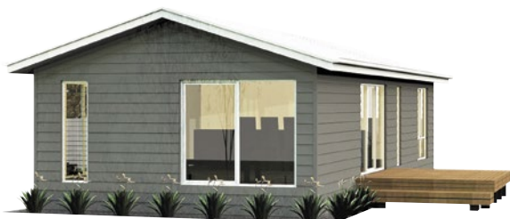
Gable – Standard