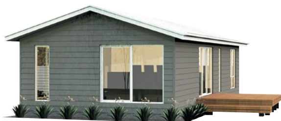
Gable – Standard